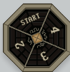
1 Start card (2-4 players)