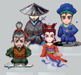
4 Character Figures