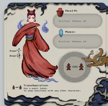
4 Character Cards